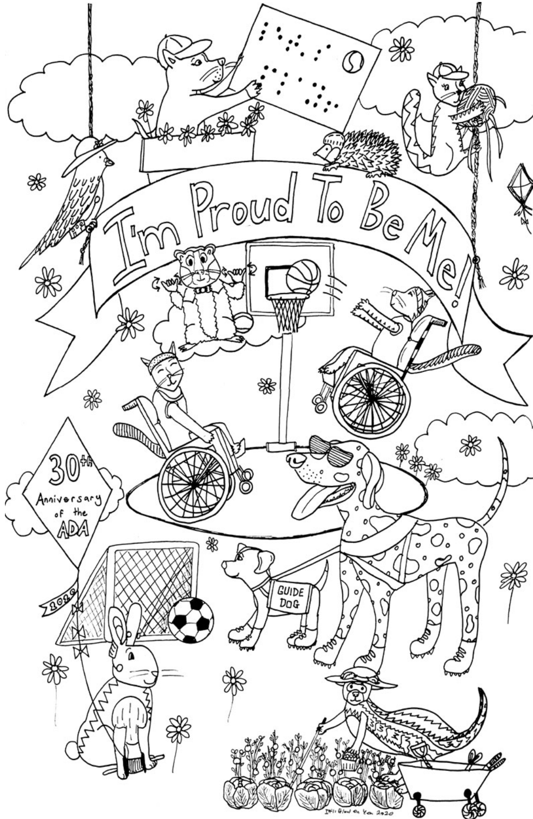
Illustration by Carolyn Kassnoff https://carolynkassnoff.myportfolio.com/ - Instagram/Twitter: @itlglowonyou